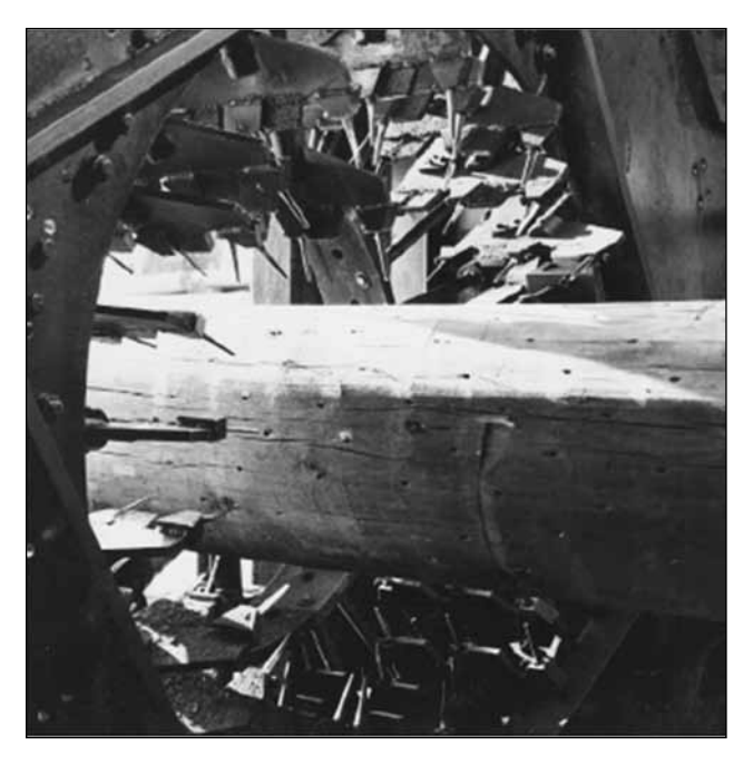
Figure 15–4. Deep incising permits better penetration of preservative.

seasoning yard, methods of piling, season of the year, timber size, and species. The most satisfactory seasoning practice for any specific case will depend on the individual drying conditions and the preservative treatment to be used. Therefore, treating specifications are not always specific as to moisture content requirements.