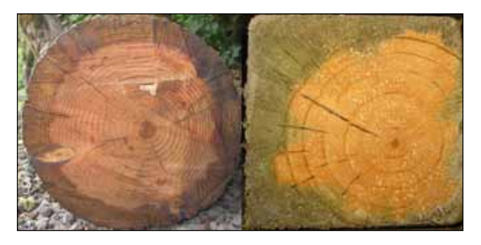
Figure 15–2. During pressure treatment, preservative typically penetrates only the sapwood. Round members have a uniform treated sapwood shell, but sawn members may have less penetration on one or more faces.

Similar comparisons have been conducted for preservative treatments of small wood panels in marine exposure (Key West, Florida). These preservatives and treatments include creosotes with and without supplements, waterborne preservatives, waterborne preservative and creosote dual treatments, chemical modifications of wood, and various chemically modified polymers. In this study, untreated panels were badly damaged by marine borers after 6 to 18 months of exposure, whereas some treated panels have remained free of attack after 19 years in the sea.