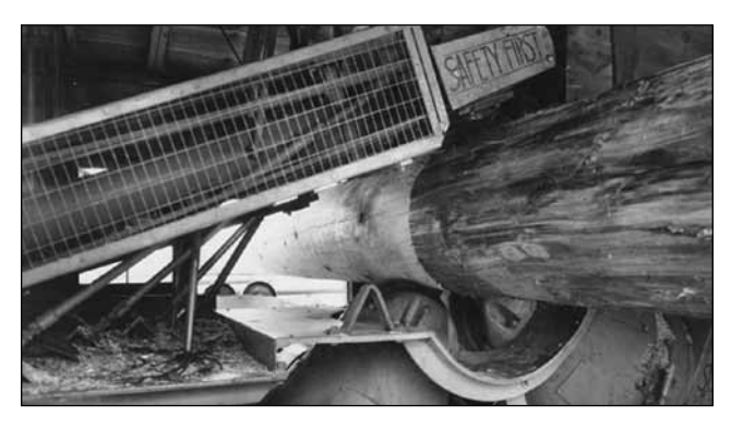
Figure 15–3. Machine peeling of poles. The outer bark has been removed by hand, and the inner bark is being peeled by machine. Frequently, all the bark is removed by machine.