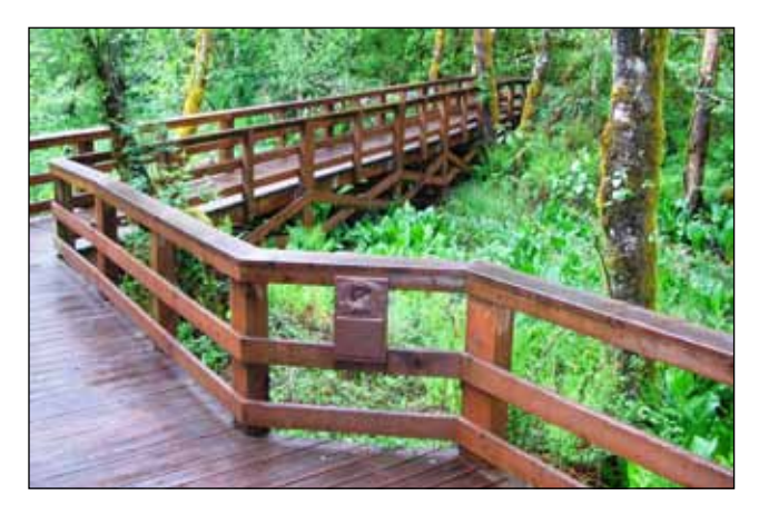
Figure 15–7. Wood preservative leaching, environmental mobility, and effects on aquatic insects were evaluated at this wetland boardwalk in western Oregon.

As with many materials, reuse of treated wood may be a viable alternative to disposal. In many situations treated wood removed from its original application retains sufficient durability and structural integrity to be reused in a similar application. Generally, regulatory agencies also recognize that treated wood can be reused in a manner that is consistent with its original intended end use.